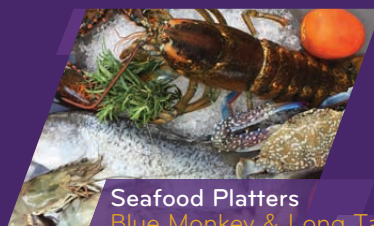
Seafood Platters Blue Monkey & Long Talay Daily 12:00 PM - 10:00 PM

Savor breathtaking panoramic views as you sample delicious cuisine from our freshly prepared BBQ Seafood Platters: