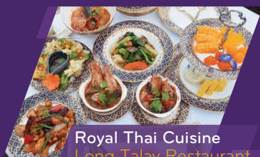
Royal Thai Cuisine Long Talay Restaurant Daily 11:00 AM - 10:00 PM

All prices selling by weight starting from 90 Baht per 100 gram.