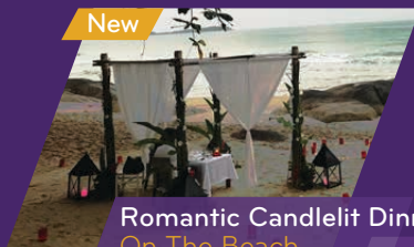
Romantic Candlelit Dinner On The Beach Daily

Experience a 4-course international degustation set menu including fresh seafood platter and beautiful table presentation with your personal butler at only THB 4,500 net per person