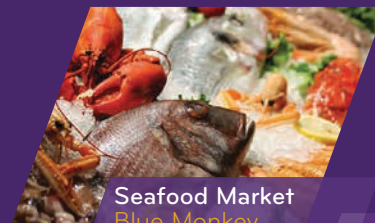
Seafood Market Blue Monkey Monday & Thursday 6:30 PM - 9:30 PM

Allow us to cook your favorite fish and seafood to perfection at our Seafood Market every Monday & Thursday night right on the beachfront.