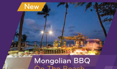
Mongolian BBQ On The Beach Saturday 6:30 PM - 10:00 PM

Welcome to the Mongolian Barbecue, Sumui's most unique dining experience. Choose from our selection of fresh meats and a large array of seasonal vegetables. Add the herbs and spices of your choice, and finally top off your creation from our specially selected sauces.